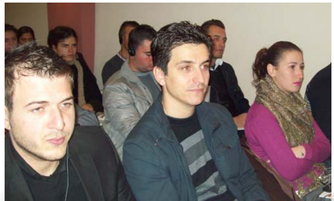
CE in Tirana, Albania