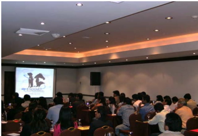
A CE session in Peru

Looking round the world, it's noticeable that our need to provide training in Europe is reducing as most countries here now have veterinary associations capable of providing their own meetings. This is a welcome development, enabling us to devote more resources to other regions.